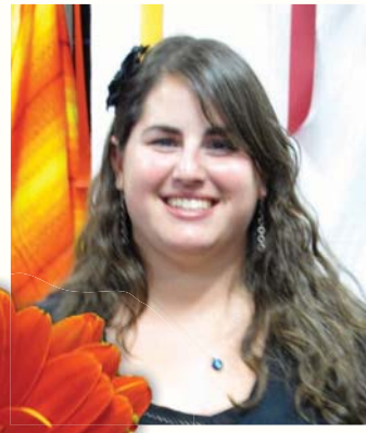
The recipient of the Rob Benzon Memorial Scholarship , in its

to make their lives successful and rewarding. I want to help others see adversity as a strength, not a weakness. With the right education and my natural motivation and strength I know my goals will be attained."